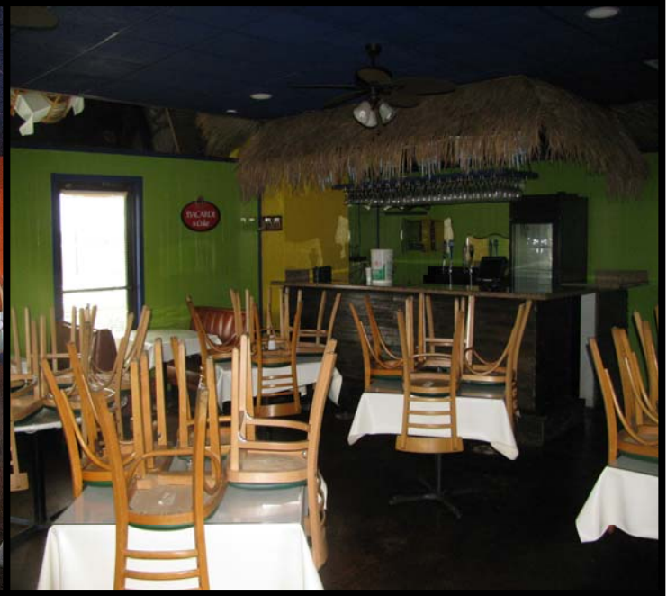
PRIVATE ROOM/LOUNGE—60 SEATS