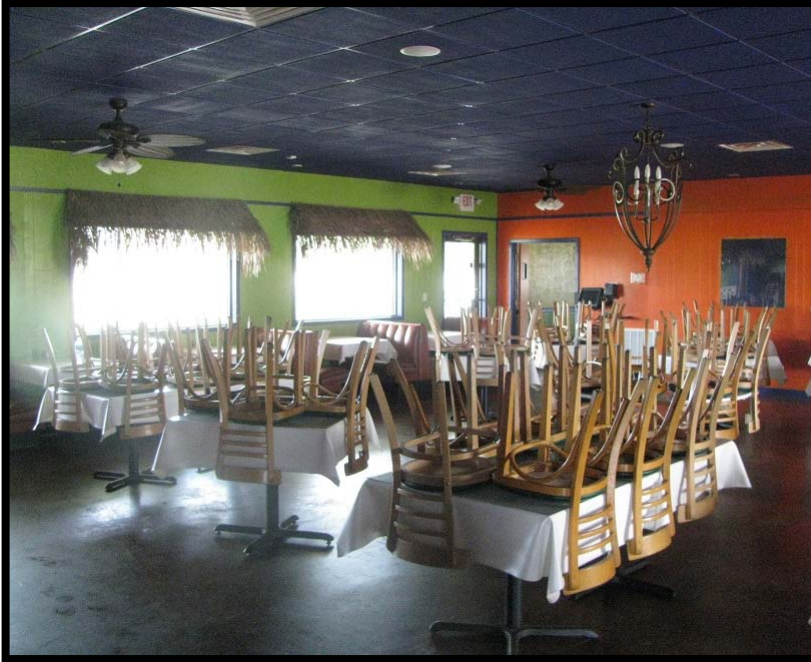
DINING AREA—OVER 114 SEATS