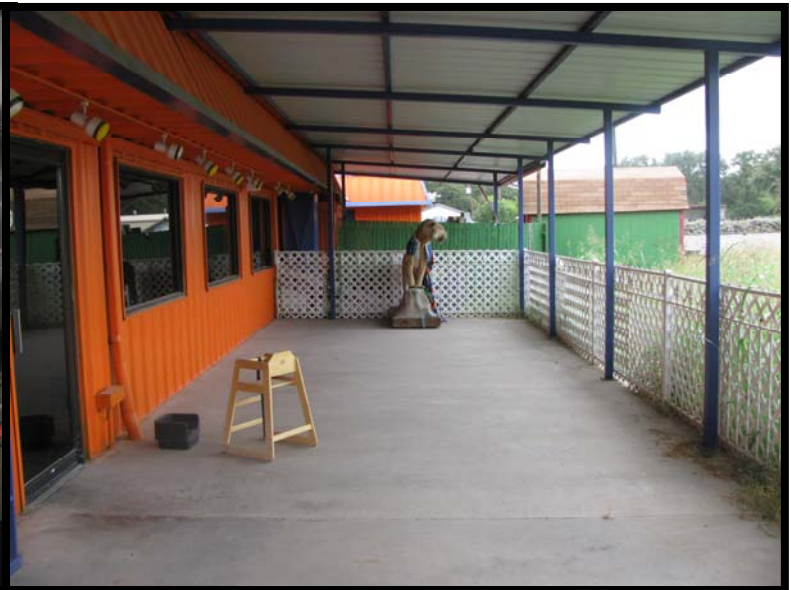
750 SF PATIO!!!