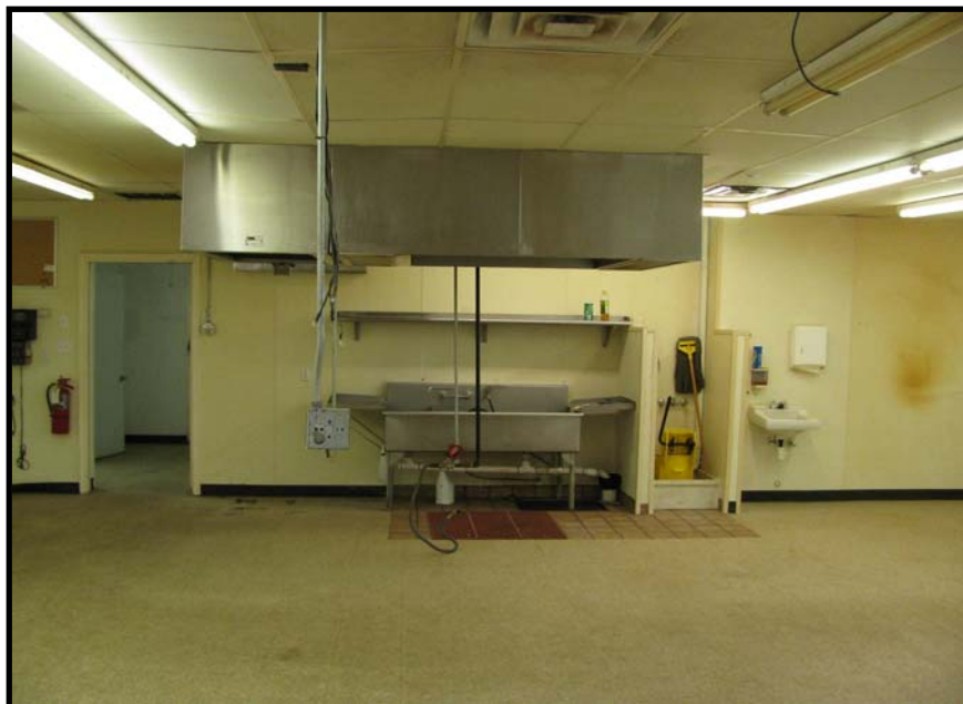
VENTAHOOD & 3-PHASE SINK