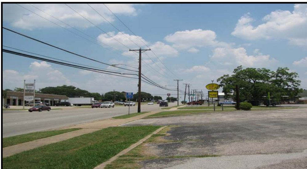
OTHER RESTAURANTS WITHIN BLOCKS