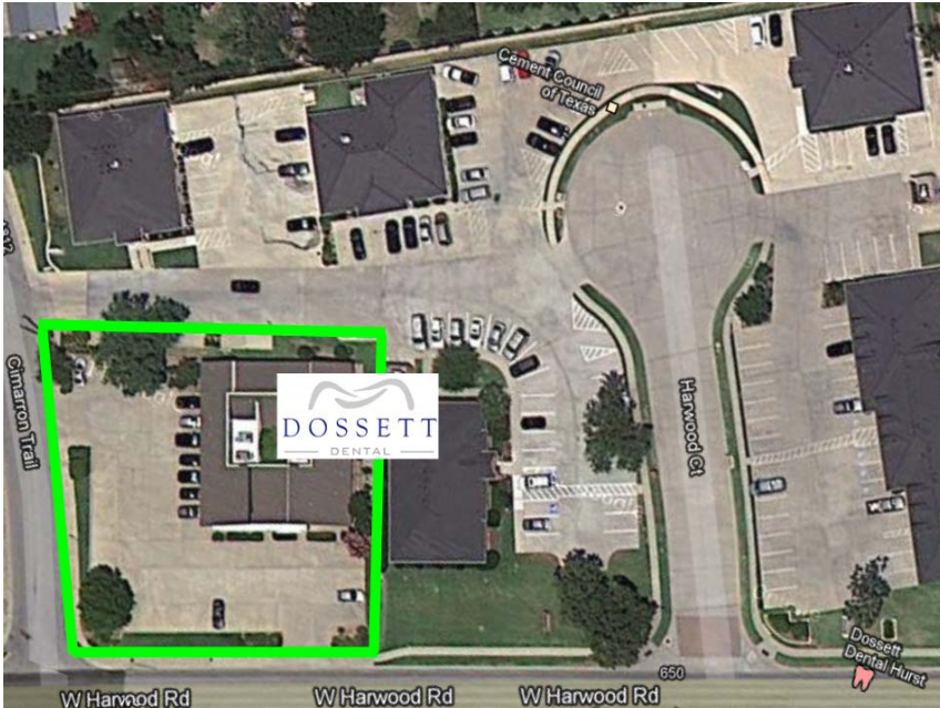
CONVENIENTLY LOCATED AT HARWOOD & CIMARRON TRAIL