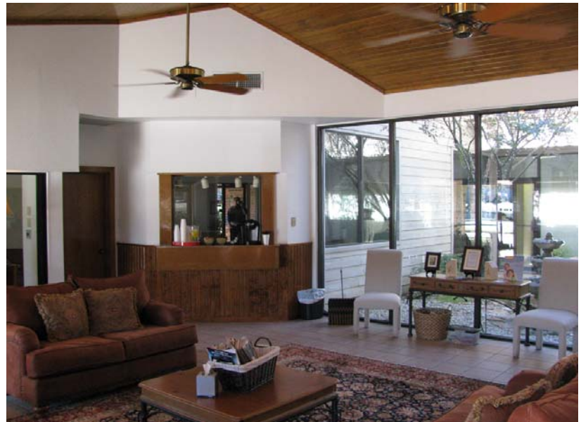
GREAT SHARED ENTRY AREA