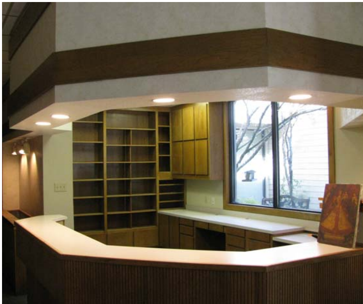
GREAT RECEPTIONIST AREA